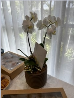
Birthday gift from members SCESWA