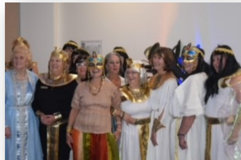
Group shot of costumes