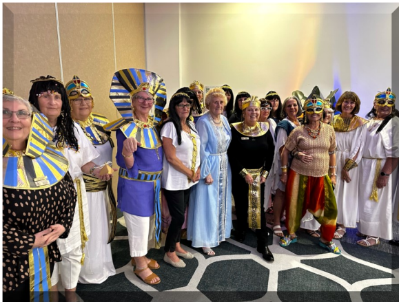
Full Group shot of costumes—excellent