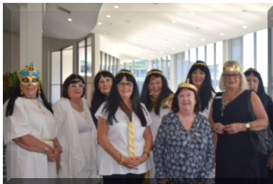
Navy women looking fabulous