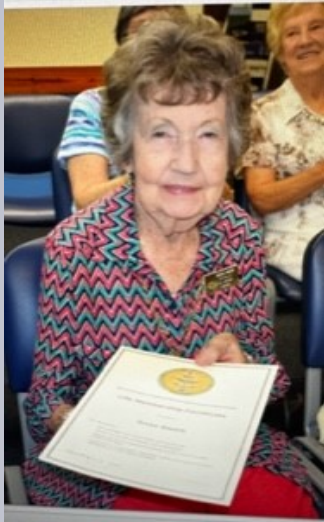
Receiving Life Membership 5 Dec 2013