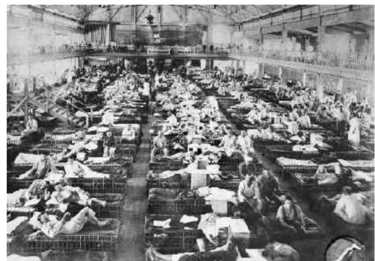
The interior of the Auxiliary Hospital which formed part of Australian General Hospital (LAGH), located in the former Hce Hotel. The inmates were from Gallipoli. AWM H18510. Heliopolis, Egypt. c. 1915

Tents were erected all around the grounds as space inside the building became scarce.