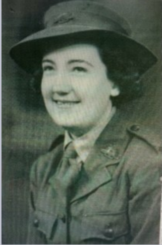
Enlistment in the AWAS