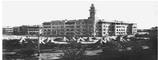
Heliopolis Palace occupied by 1st Australian General Hospital (LAGH). Heliopolis, Egypt. c. 1916

Tents were erected all around the grounds as space inside the building became scarce.