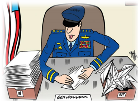
This guy obviously helped the WRAAF Singers make their planes