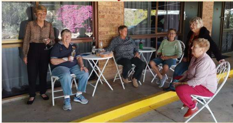
Birthday bubbles, Longreach