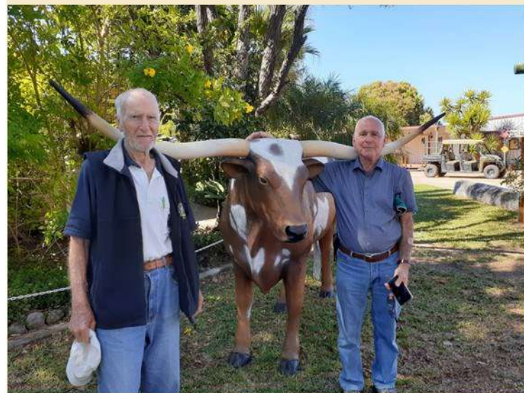
Texas Longhorns, Charters Towers