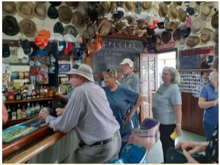
Thirsty travellers at the Wellshot Hotel, Ilfracombe