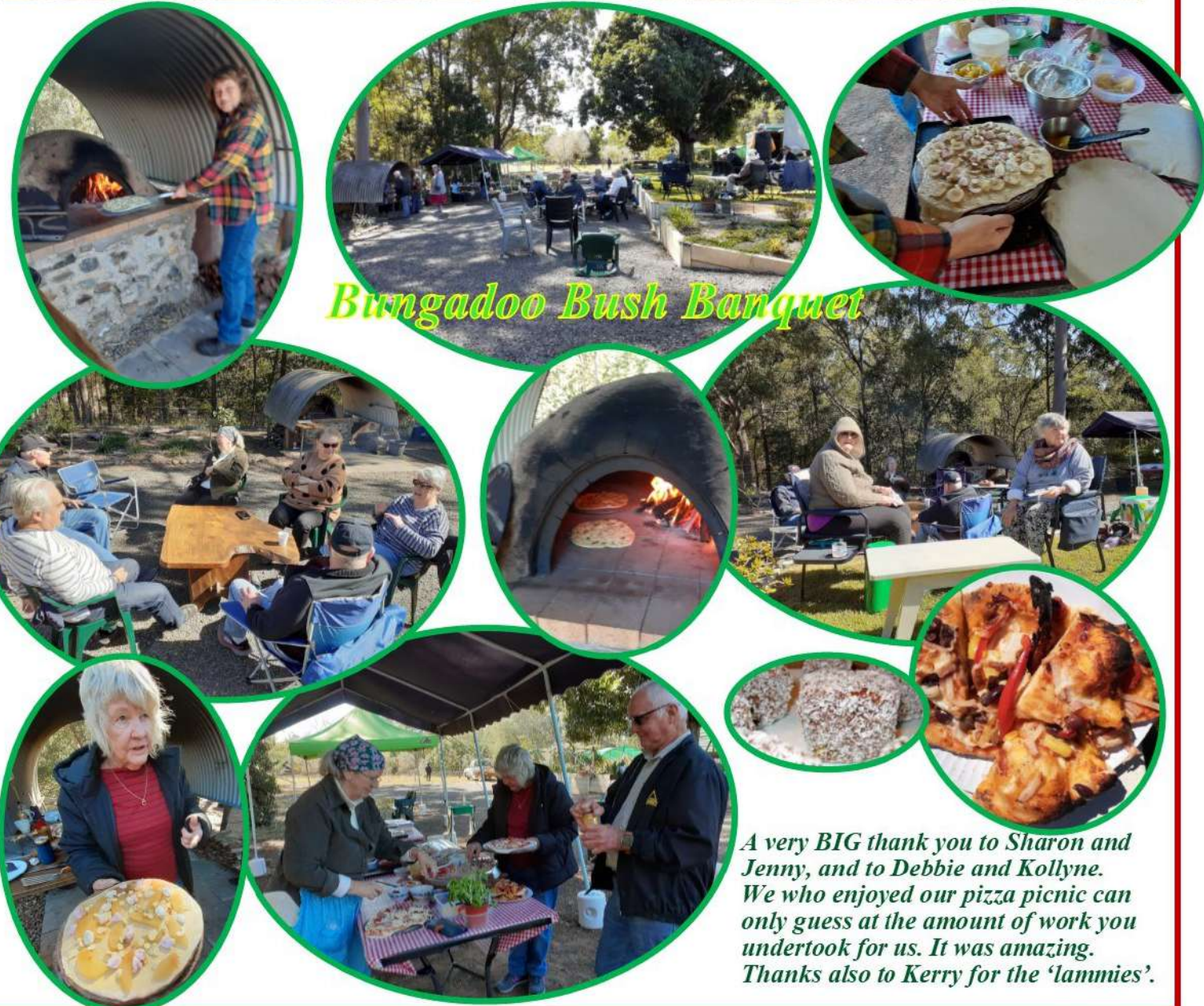
Bungadoo Bush Banquet