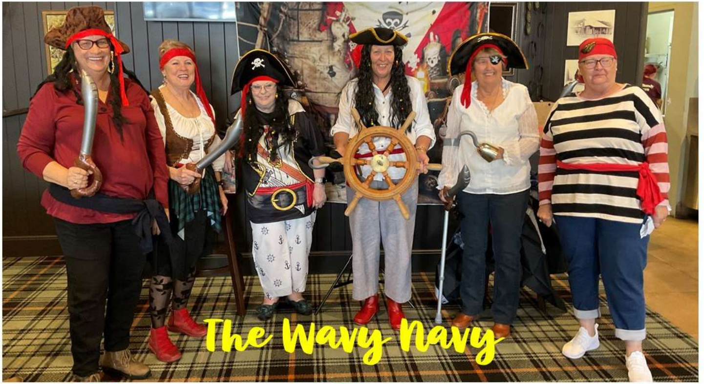
The Wavy Navy