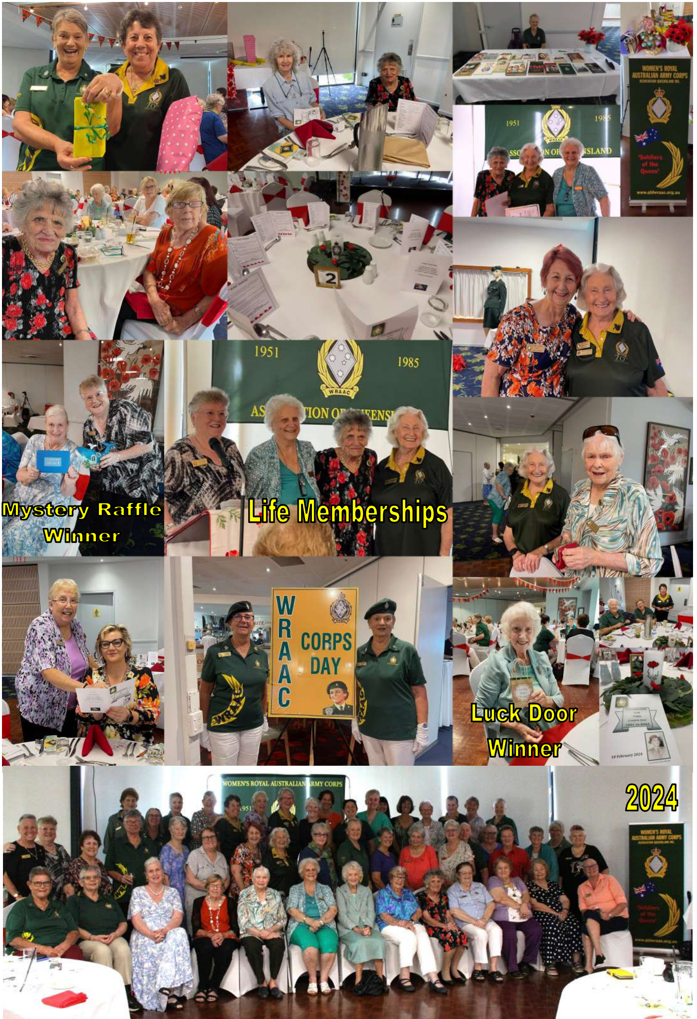
Mystery Raffle Winner