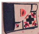
Smaller knee cover