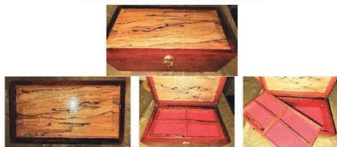
Wooden Storage Box or Wooden Jewellery Box 2

PAYMENT by Direct Deposit Navy Women (WRANS-RAN) Qld Subsection BSB: 124 085 Account #: 22446885 Ref: (Surname) Raffle