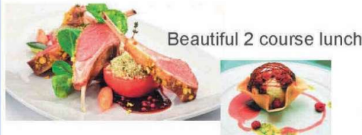
Beautiful 2 course lunch