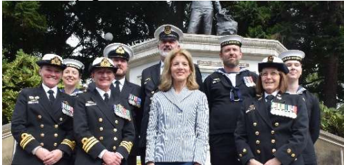
HMAS Moreton Officers & sailors with Amb Kennedy

On 27 July, the Jack service acknowledged all Coastwatchers, and the special guest was the daughter of J F K who owed his life to the Coastwatcher. Full story over a few pages.