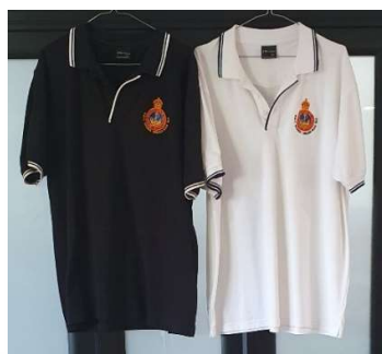
JB POLO SHIRTS with EMBROIDERY on right side

Formal Occasions: (Funerals; ANZAC Day) White skirt, pants or dress, worn with the white shirt, black jacket with the magnetised pocket badge, and white hat with our Tally Band. Shoes to suit. Alternatively, the black blouse can be worn in lieu of white shirt and black jacket.