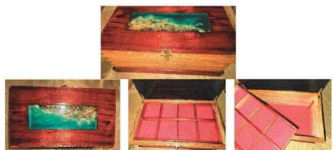
Wooden Storage Box or Wooden Jewellery Box 1