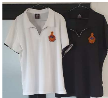
AUSSIE PACIFIC POLO SHIRT with EMBROIDERY on right side

Informal Occasions: (Coffee mornings, bus trips, social gathering) Black tops with your choice of bottom half. Wearing of medals: Large medals are worn for events that commence in the day time; Miniatures are worn for events that commence at night.