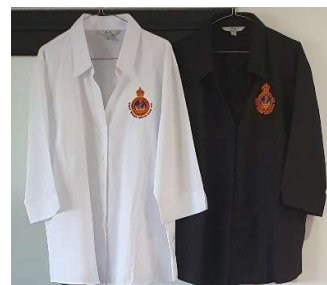
BIZ OASIS button front SHIRT with EMBROIDERY on right side

Orders for shirts and name tags take 3 weeks. Payment must be received before orders are placed.