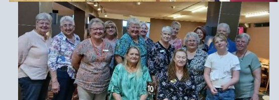
Defence Women at June, July & August