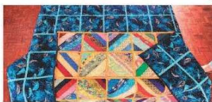
Double Sided Large spread 200cm x 195cm

DRAWN at the Sub-Section's 60th Anniversary Lunch – 3 February 2024