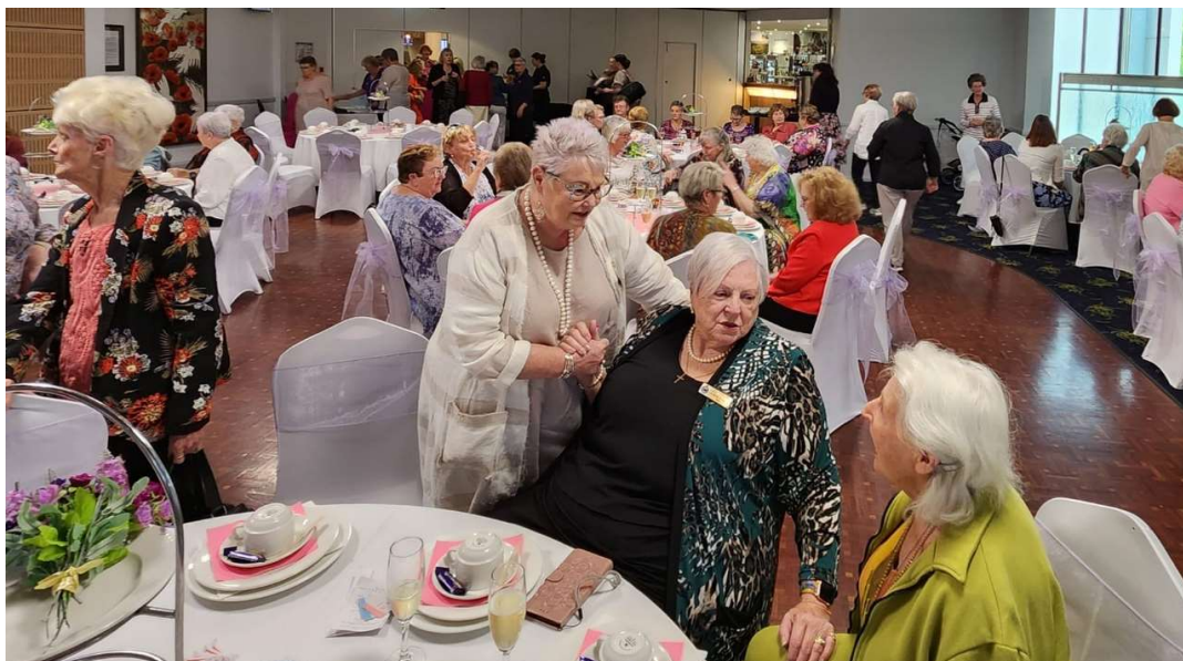
In the beginning, finding our seats, greeting acquaintances that have been too long between catch ups.