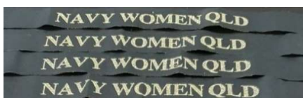
^ TALLY BAND