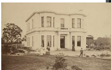
Pictured above ^^ is Lorimer House and pictured right the Opening of Greenwich House