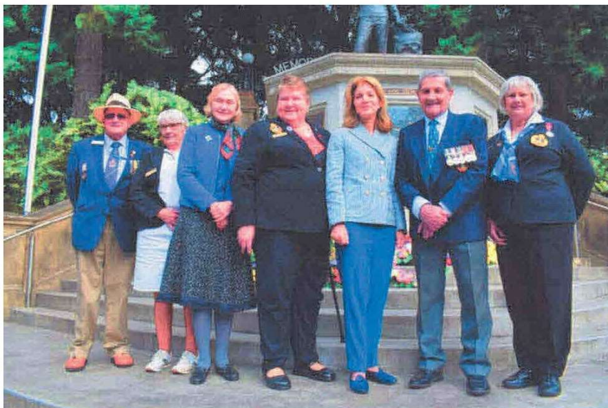
Above: The NAA Qld Section was presented with a replica of the "Message on a coconut" by Ambassador Caroline Kennedy, at the end of the service