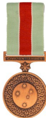
Civilian Service Medal 1939-1945