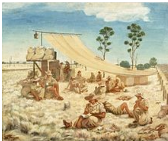
A painting titled Smoko time