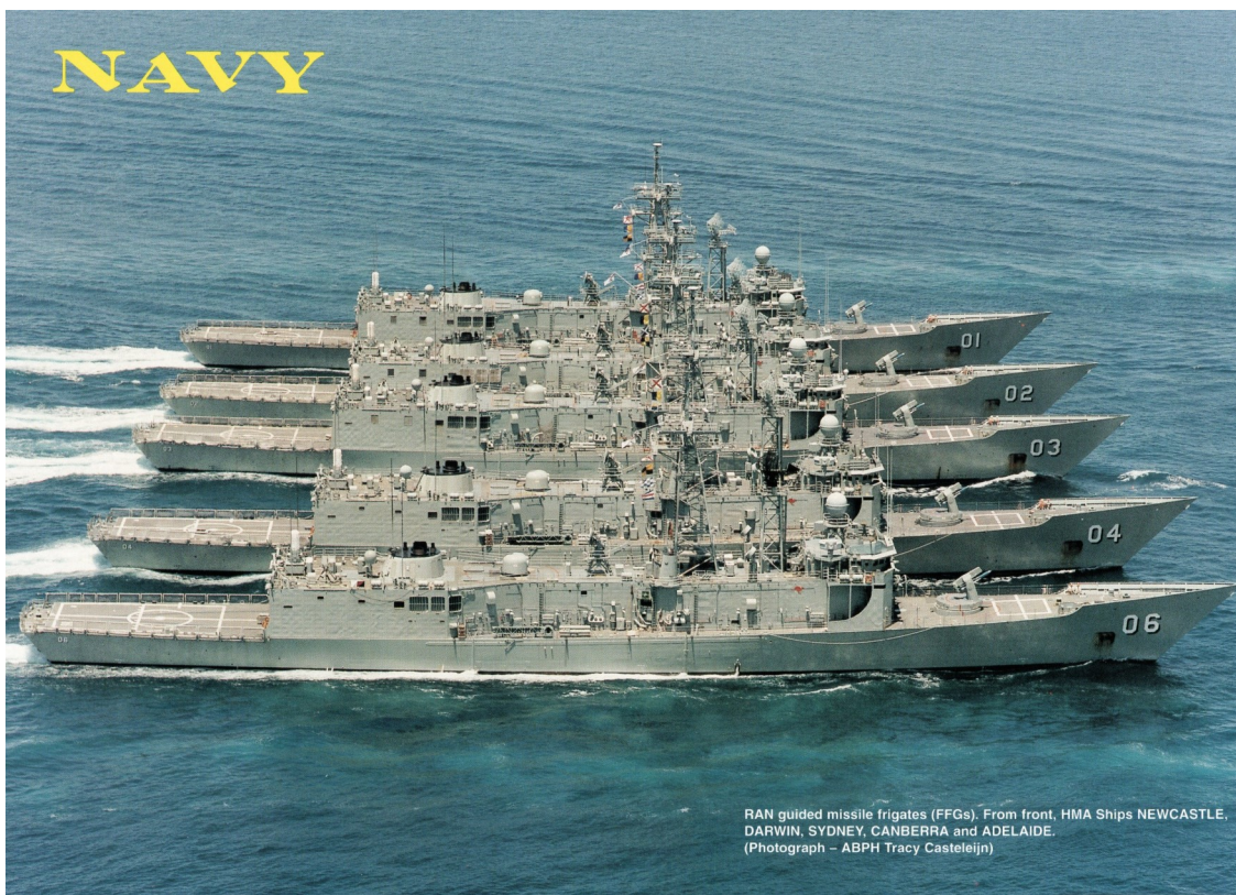
RAN guided missile frigates (FFGs). From front, HMA Ships NEWCASTLE, DARWIN, SYDNEY, CANBERRA and ADELAIDE.

Let the best job in the Navy begin! Posted to HMAS Kuttabul , Navy Imagery Unit-East (NIU -E) on Garden Island in Sydney, as a newly graduated Able Seaman Photographer (ABPH) to consolidate my training, I was off to a cracking start with a deployment to Exercise Kakadu II, a multi-nation exercise off the coast of Darwin, Northern Territory, where I took the most famous photo of my entire career (5 FFG's all abreast). This photo went 'viral' so-to-speak, attracting world-wide acclaim including the US Navy congratulating me on such an awesome image.