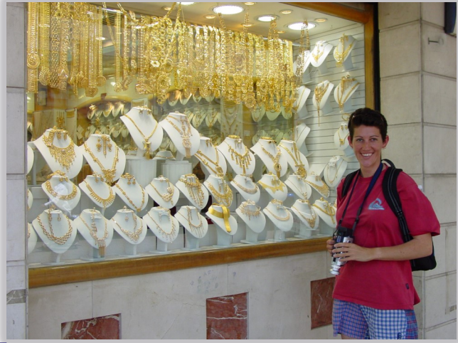
Shopping in the Gold Souk in Dubai in 2002

On promotion to Petty Officer Photographer (POPH) in 2003 I was posted to Photographic Training Flight at RAAF East Sale as the sole Navy Instructor where I delivered professional photography training to Navy and Air Force personnel. Being a teacher does not come naturally to me so this was one of my more difficult postings but embracing the opportunity it was an invaluable personal growth experience. In addition to the teaching challenge, one of those experiences was performing the role of parade commander for a basic photography course graduation. Quite the daunting task but I lead that parade with aplome and felt particular pride in that achievement. Another out-of-the-ordinary task was to lead an ANZAC Day parade through the City of Sale, Victoria and lay the wreath as Navy's representative alongside the most senior Air Force and Army officers in the region. Again, a nerve-wracking task and again, a proud moment and sense of achievement. In 2006 I was posted to Navy Headquarters in Canberra as Staff Officer Navy Marketing. This was a newly created position for a POPH where I learned about corporate branding and marketing. A very interesting and creative role, this was a terrific job where I was involved in the development of Brand Navy, developed imagery databases and produced imagery-based marketing products such as yearly RAN calendars.