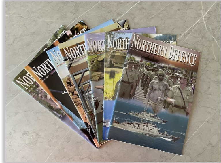
A selection of Northern Defence Magazines which I contributed imagery to from 2000 to 2002