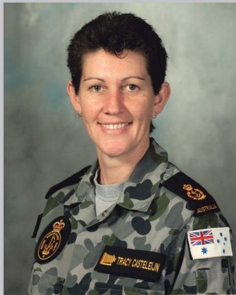
Portrait as a CPOIS in Disruptive Pattern Navy Uniform at NIU-W

In 2009 the Photography category's name was changed to Imagery Specialist (IS) to better describe our wide and varied roles so I became CPOIS. I thoroughly enjoyed this posting. My staff and I received numerous accolades for the imagery support we provided and I jumped at the chance to complete the Navy Women's Mentoring Program and to participate in the Perth Women's Leadership Symposium. What a fabulous personal growth opportunity that was. In 2013 I was posted to HMAS Harman (Navy People Career Management Agency) in Canberra as the Intelligence Categories' Career Manager where I managed the postings for Imagery Specialist, Imagery Analyst, Cryptologic Linguist, Cryptologic Systems and Electronic Warfare category sailors. This was one of my most challenging but rewarding roles.