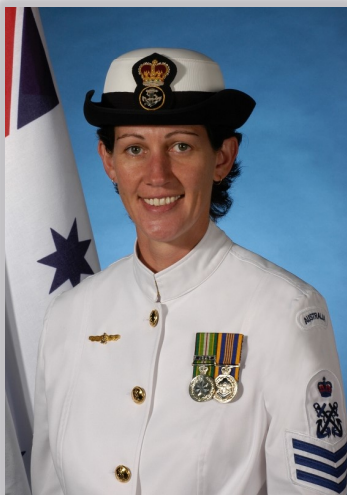
Official Portrait as a Petty Officer at Flight Training, RAAF East Sale

On promotion to Petty Officer Photographer (POPH) in 2003 I was posted to Photographic Training Flight at RAAF East Sale as the sole Navy Instructor where I delivered professional photography training to Navy and Air Force personnel. Being a teacher does not come naturally to me so this was one of my more difficult postings but embracing the opportunity it was an invaluable personal growth experience. In addition to the teaching challenge, one of those experiences was performing the role of parade commander for a basic photography course graduation. Quite the daunting task but I lead that parade with aplome and felt particular pride in that achievement. Another out-of-the-ordinary task was to lead an ANZAC Day parade through the City of Sale, Victoria and lay the wreath as Navy's representative alongside the most senior Air Force and Army officers in the region. Again, a nerve-wracking task and again, a proud moment and sense of achievement. In 2006 I was posted to Navy Headquarters in Canberra as Staff Officer Navy Marketing. This was a newly created position for a POPH where I learned about corporate branding and marketing. A very interesting and creative role, this was a terrific job where I was involved in the development of Brand Navy, developed imagery databases and produced imagery-based marketing products such as yearly RAN calendars.