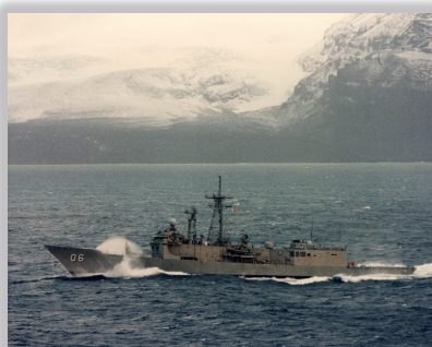
HMAS Newcastle at Heard Island Great Southern Ocean 1998

Also in 1998, I completed a Southern Ocean deployment in HMAS Newcastle to Heard Island which earned me the Australian Operational Service Medal-Border Protection. We were patrolling for Patagonian Toothfish poachers in Australian waters. Although such conditions can be very dangerous as you move around the ship, the big tall roughers of the Southern Ocean were exciting and great fun. The motion of the ship plunging down a wave would fling you from the bottom to the top of a ladder in a second. The bright orange mustang suits required to be worn on the upper decks to prevent hyperthermia and photographing from the ship's helicopter with Heard Island in the background was a fabulously unique experience. To put the icing on the cake, we did indeed apprehend poachers and escorted the vessel back to mainland Fremantle.