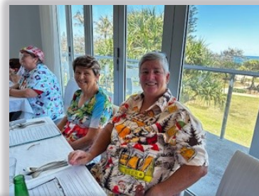
SCESWA members at the Lind Lane production of "Nancy Wake"