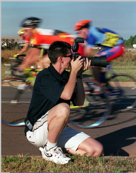
Photographing an ADF cycling event in Darwin 2002

In 1999 I posted to HMAS Coonawarra in Darwin (Defence Public Affairs-Northern Territory) where I was part of a Tri-Service public affairs team made up of a Navy LSPH (me), an Air Force Corporal Phot, an Army Corporal Phot, an Army Sergeant Videographer, an Army Captain Public Affairs Officer and a civilian Public Affairs Officer. We covered military activities in both video and stills photography across the entire top end and included East Timor operational tasking. This was one of my favourite postings as I got to experience a huge range of military activities and I got to visit Indigenous communities like Borroloola and the Tiwi Islands. During my time in Darwin, I became friends with an Army WO2 Clerk, who was loan-posted to our PA Team. We will always remain friends and keep in touch. She is a current member of the Women's Royal Australian Army Corps (WRAAC) Association Queensland and we catch up at the annual Tri-Service Women's Luncheon in Brisbane. Also, whilst in Darwin I reconnected with two Air Force friends that I served with at ADFA in the early 90's, one of which I am still in touch with today.