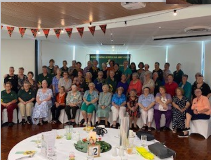
Women's Royal Australian Army Corps 73rd Corps Day at Geebung RSL