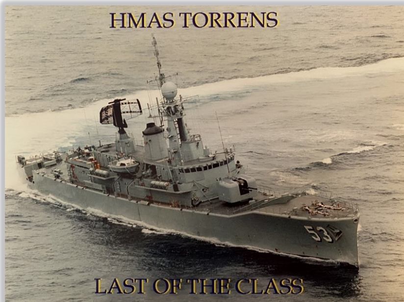
HMAS Torrens Last of the Class poster produced by Tracy in 1998 during Torrens' decommissioning deployment

On promotion to Leading Seaman Photographer (LSPH) in 1997 I was posted to the RAN Tactical Electronic Warfare Support Section (RANTEWSS) in Albatross , learning the extra-curricular skill of Imagery Analysis to qualify for the position. I completed two South East Asia deployments in HMAS Adelaide which included multi-nation exercises and port visits in Singapore, Malaysia, Thailand and Indonesia. In Indonesia in 1998, I cross-decked from Adelaide to HMAS Torrens , the last of the RAN's Destroyer Escort (DE) class, for her decommissioning deployment and visited ports in the Pacific including Port Moresby and Noumea. Here I served with one of my best mates of whom was a Leading Seaman Naval Police Coxswain (NPC). She had transferred to NPC from a Motor Transport Driver (Truckie) and we had served together previously at Albatross . We will always remain besties and we keep in touch.