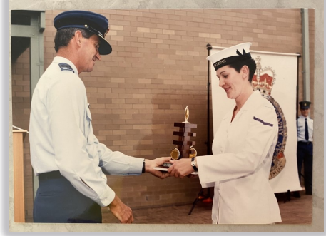
Being awarded the "Most Conscientious and Consistent Effort" perpetual trophy.

Let the best job in the Navy begin! Posted to HMAS Kuttabul , Navy Imagery Unit-East (NIU -E) on Garden Island in Sydney, as a newly graduated Able Seaman Photographer (ABPH) to consolidate my training, I was off to a cracking start with a deployment to Exercise Kakadu II, a multi-nation exercise off the coast of Darwin, Northern Territory, where I took the most famous photo of my entire career (5 FFG's all abreast). This photo went 'viral' so-to-speak, attracting world-wide acclaim including the US Navy congratulating me on such an awesome image.