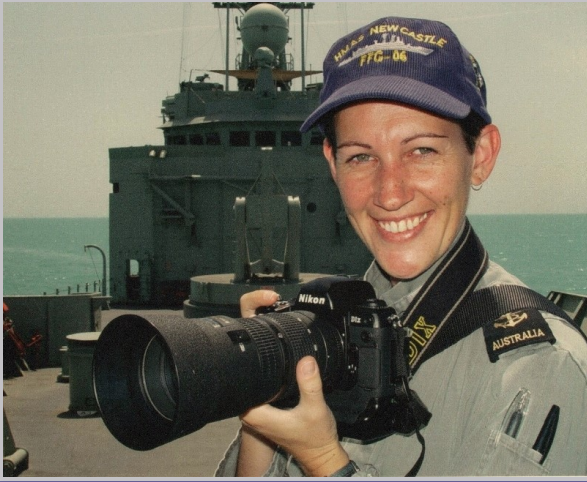
On the forecandle of the HMAS Newcastle in the Arabian Gulf in 2002