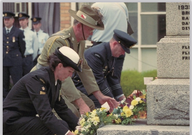
Leading the City of Sale ANZAC Day march alongside Army and Air Force

On promotion to Chief Petty Officer Photographer (CPOPH) in 2007 I was posted to HMAS Stirling as Officer-in-Charge Navy Imagery Unit-West (OIC NIU-W) where I managed a team of six Photographers to provide all photographic support requirements for HMAS Stirling and its many lodger units plus the RAN Submarine Fleet and west-based seagoing platforms.