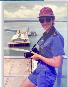
Atop Darwin's Iron Ore Wharf crane gathering imagery for Exercise Kakadu 11 in 1995.

Some healthy rivalry existed amongst us Photos to get our pics on the front page of Navy News. I am happy to say that I did indeed achieve a few Navy News front pages during my time at NIU-E. In 1995, this time as a Phot, I was posted back to HMAS Albatross , where the majority of tasking was technical industrial photography supporting air craft maintenance reports, plus public affairs photography and a lot of group photography. This was all by hand black-and-white film and print processing which is now a lost art but I could do it all again right this second. I will always miss silver-based film and print photography.