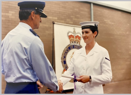
Being presented with her Basic Photography Graduation Certificate