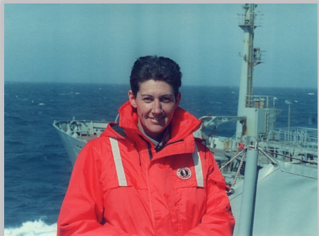
In my Mustang Suit on HMAS Newcastle during a replenishment at Sea with HMAS Westralia 1998